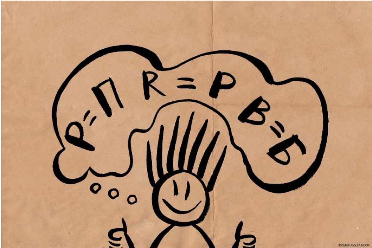
By Mila Gilmanova Illustrations @milkamurzilka